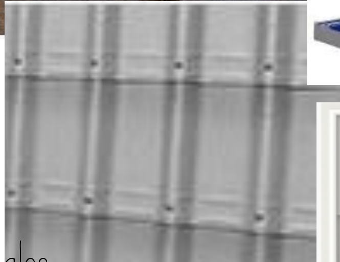
Onduvilla Shingles (Weather Resistant, Last a Lifetime)