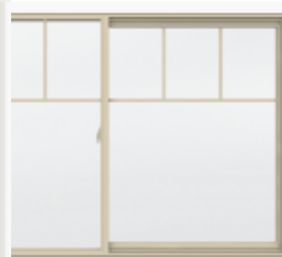
JELD-WEN Windows (Tinted Glass)